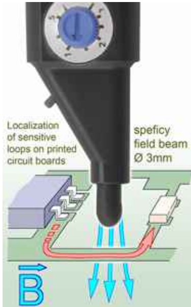
Design of P11 mini burst field generator